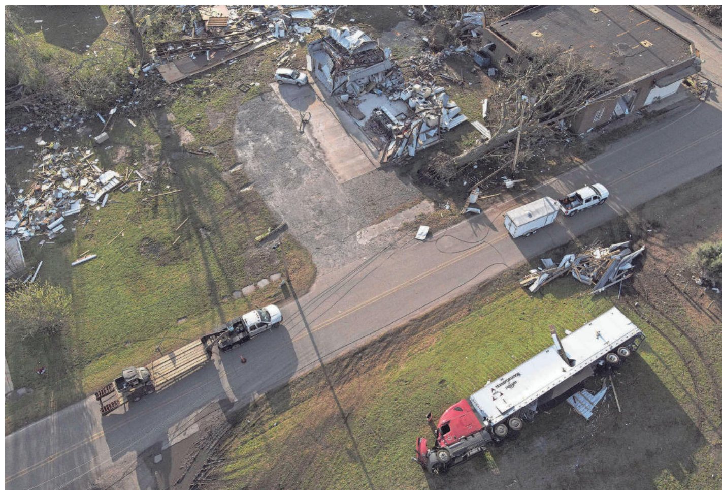
Emergency officials in Mississippi say several people have been killed by tornadoes that tore through the state on Friday night, destroying buildings and knocking out power.