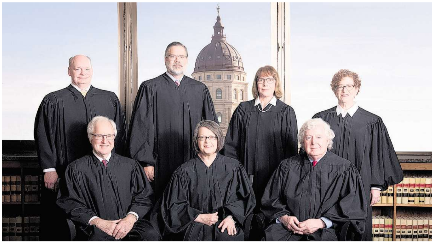
The justices of the Kansas Supreme Court