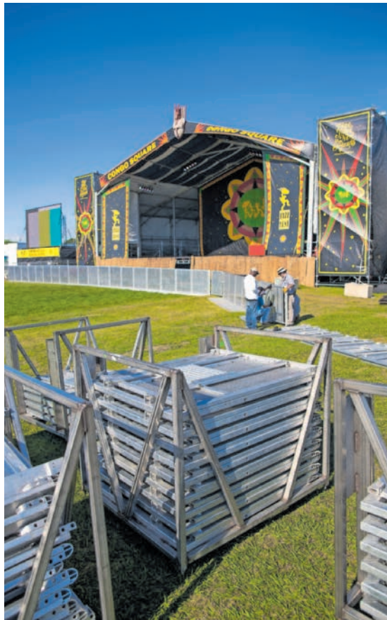
Barricades are installed to get ready for the tens of thousands of music fans who will visit the Fair Grounds.

For Friday and Saturday's Jazz Fest cubes, see A8