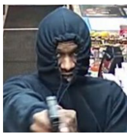
SOUTHFIELD Armed robbery suspect sought Local » A3