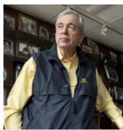
U-M SPORTS Official says doctor molested him Sports » B1