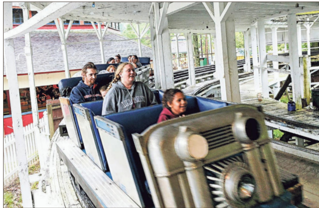
Riders are seen on the historic Blue Streak roller coaster at Conneaut Lake Park, the nonprofit corporation that oversees amusement park operations, filed for federal Chapter 11 bankruptcy protection in 2014.