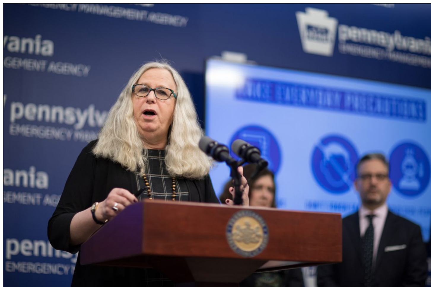
COMMONWEALTH MEDIA SERVICES

Exton lab conducting more tests; most patient costs to be absorbed