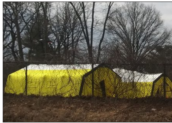
The Montgomery County Department of Public Safety has set up a tent behind the former Audubon Elementary School to be used as a testing site for the coronavirus.